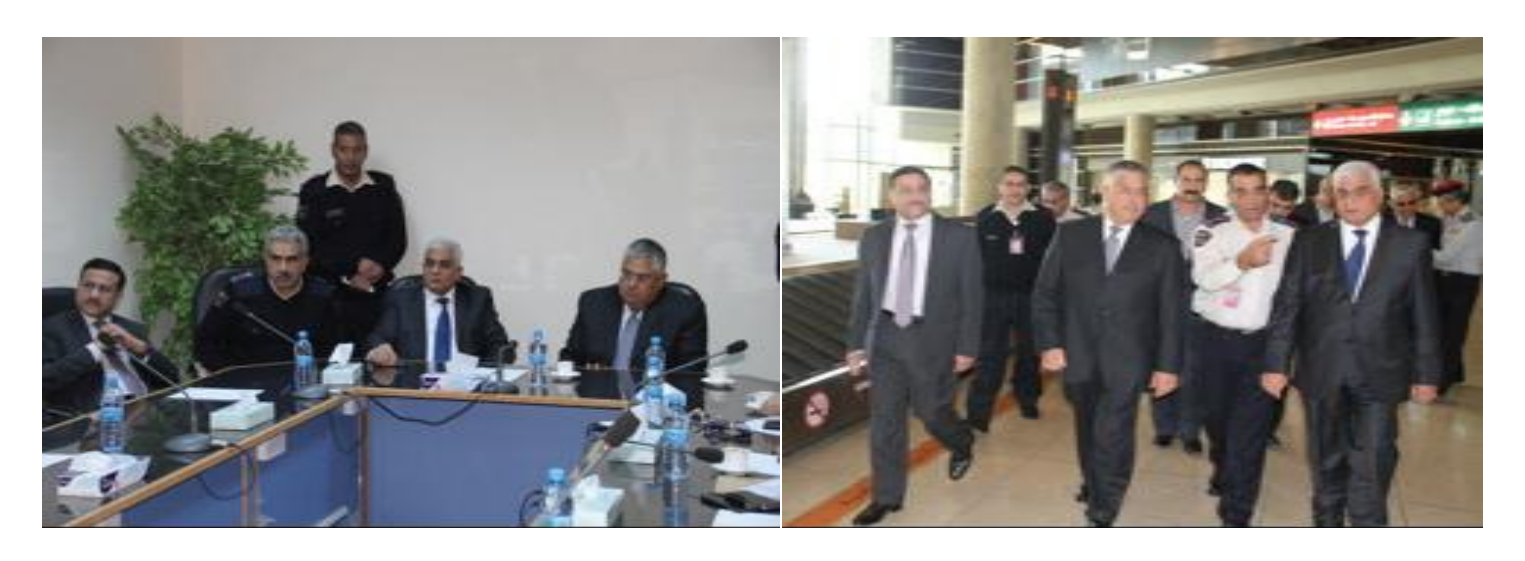
H.E. Minister of Finance and H.E. The Director General of Jordan Customs during an inspection visit to Queen Alia International Airport Customs Center.