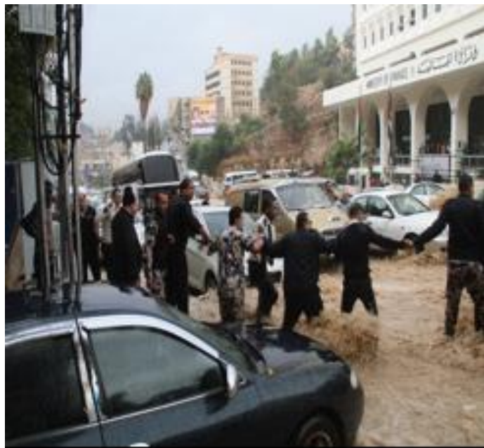
Customs Department officers depicting national heroic models during the rain storm that hit the kingdom in 2015.