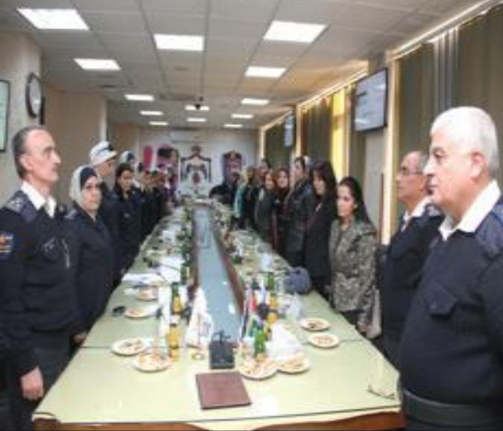
Recognition of the sincere efforts and bearing the responsibility of Customs work with honesty and dedication Director General honors a number of retired employees in a ceremony.