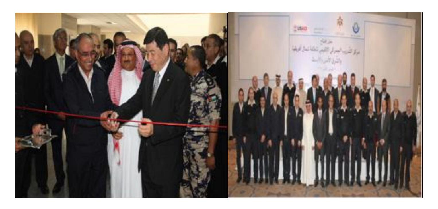
In order to support the efforts of Jordan Customs and develop its work to provide a high quality training to its employees and the relevant authorities, the Regional Customs Training Center for North Africa and the Near and Middle East was inaugurated in Amman.