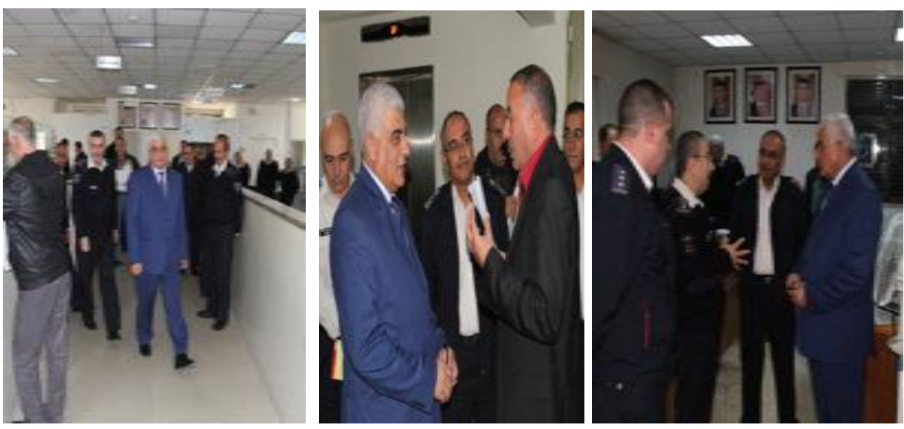
H.E. Director General of Jordan Customs in a field tour to the main units of the Department