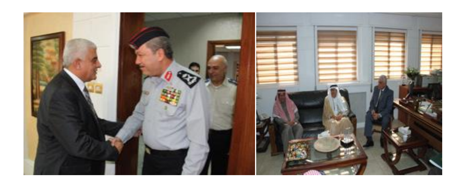
H.E. Director General of Jordan Customs receives H.E. Director General of Civil Defense