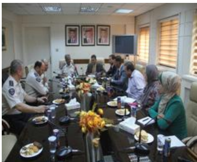
In order to entrench the principle of community partnership and to preserve the environment, Customs Department and Jordan Environment society has signed an agreement on paper recycling.