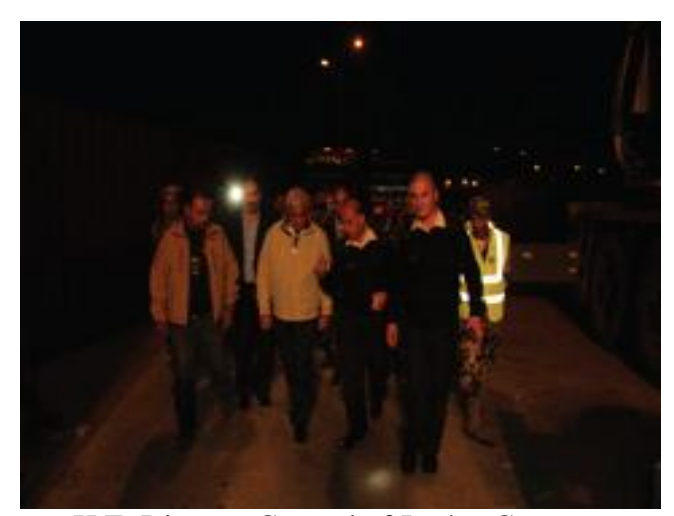
H.E. Director General of Jordan Customs in an tour to Amman Customs House