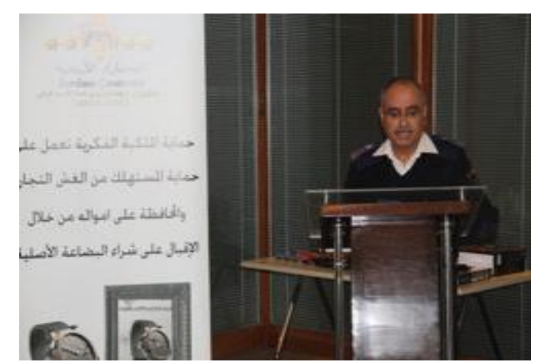
Asst. Director General of Customs for Technical Affairs inaugurates a workshop on Intellectual Property