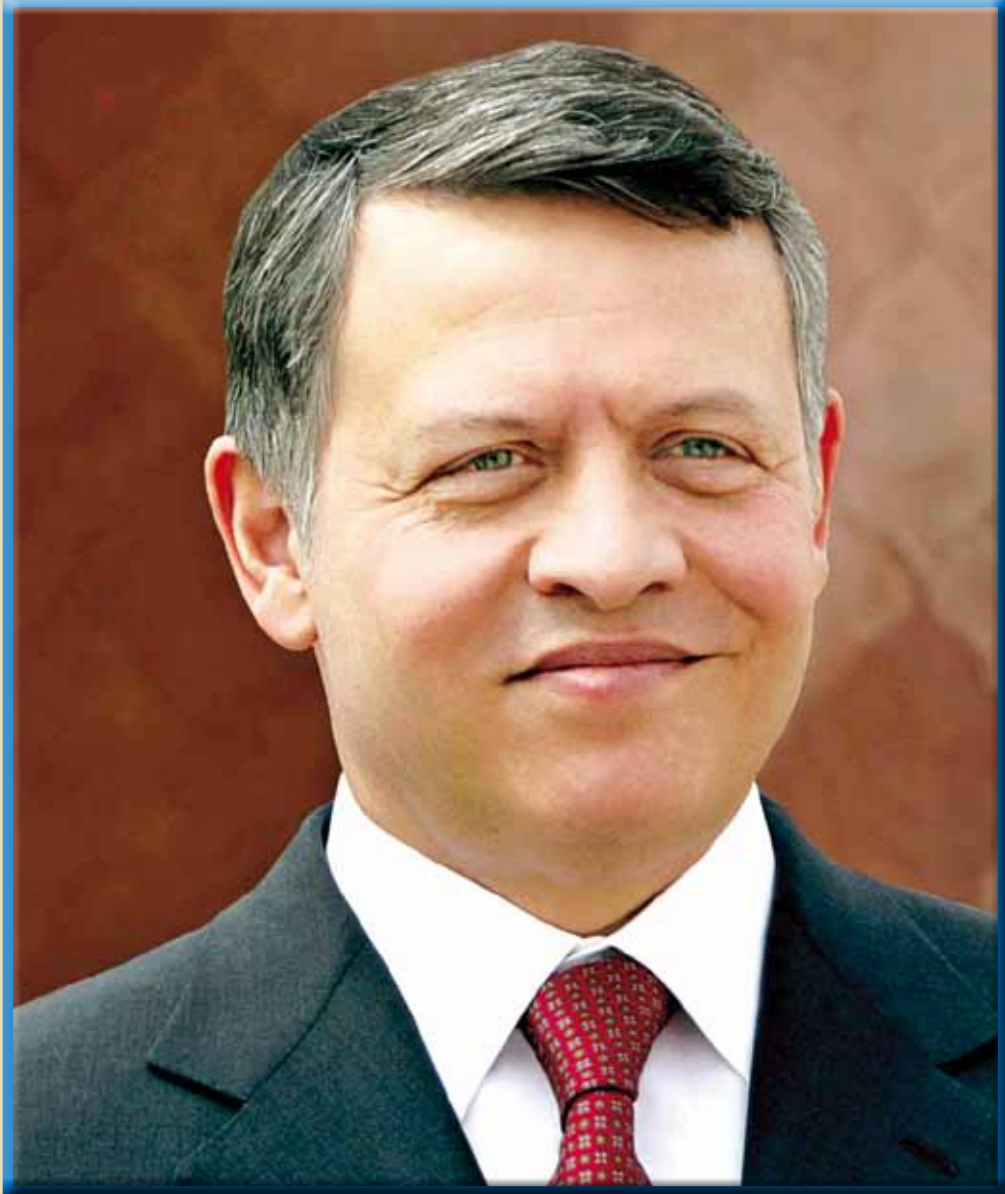
His Majesty King Abdullah II Bin Al Hussein