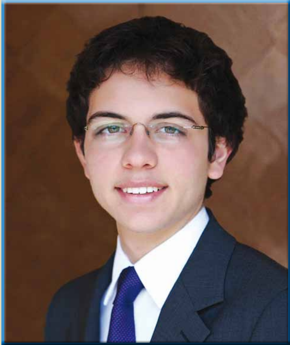
His Royal Highness Crown Prince Hussein Bin Abdullah II